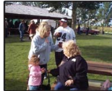
BIG ON COMMUNITY