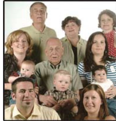
BIG ON FAMILY